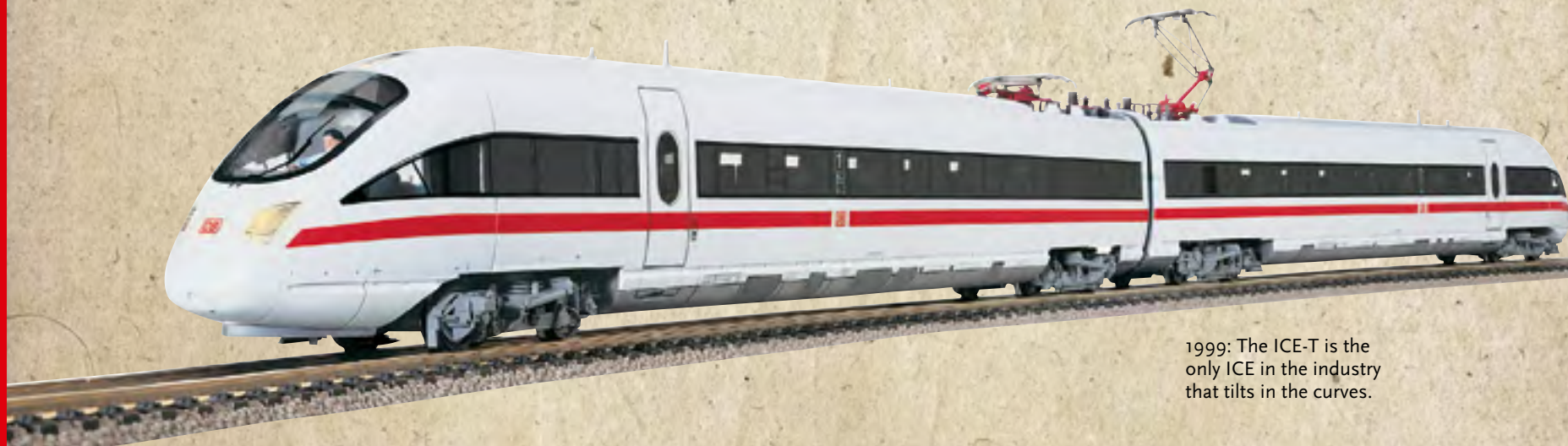
1999: The ICE-T is the only ICE in the industry that tilts in the curves.