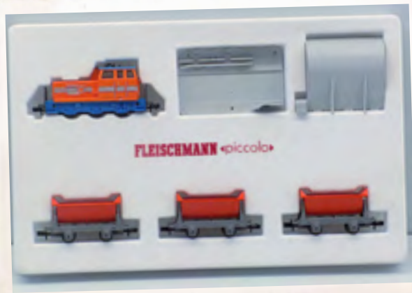
The little lorry train in track N was presented for the first time in 1968/69.