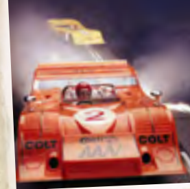
Illustration right: Porsche CAN-AM of the car rally in 1979