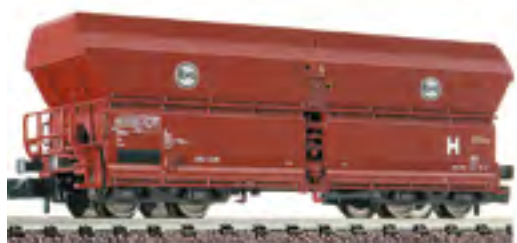
852313, Ep. IV