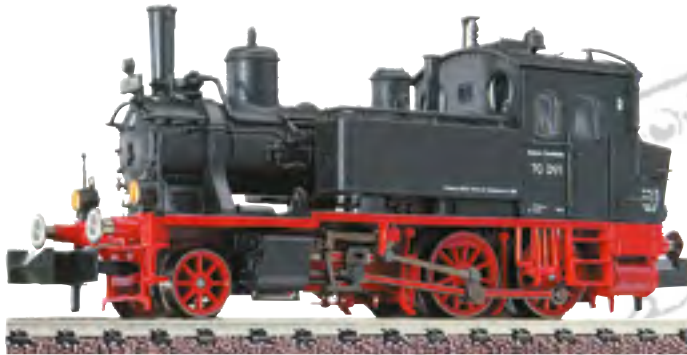
707000 Steam locomotive BR 70.0 of the DB, Epoch III