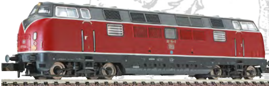
725000 Diesel locomotive BR 221 of the DB, Epoch IV with digital interface