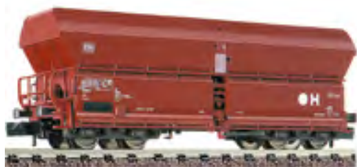
852311, Ep. IV

Every wagon can be purchased individually for € 19,90 at your specialized dealer.