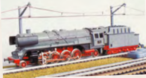
Illustration left: BR 41 on H0 track (1957 - 1960)