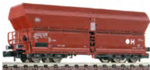
852312, Ep. IV