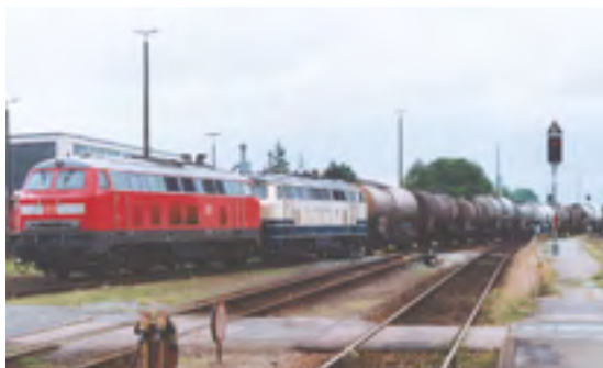
Kesselwagen eignen sich hervorragend für das Zusammenstellen von Ganzzügen.