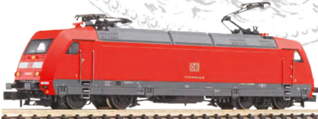
735500 Electric locomotive BR 101 of the DB AG, Epoch IV with digital interface