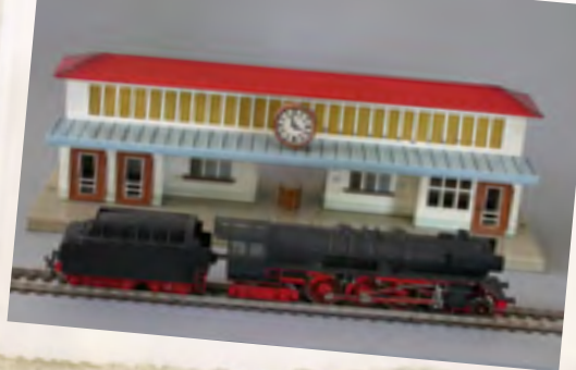
Illustration middle: Hand held model of the 05 001, on track 0