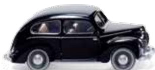
0820 03 Ford Taunus G73A