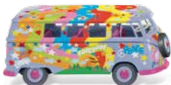
0797 14 VW T1 Bus