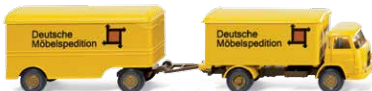
0540 03 Furniture trailer truck (MAN)