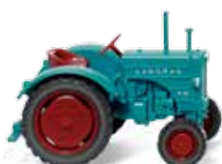
0885 05 Hanomag R 16