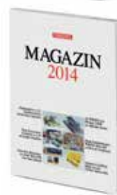
0006 21 WIKING "MAGAZIN 2014"

Beautiful classics – updating the range of models with lots of contemporary verve is what makes this possible! The VW "Bulli" of the first generation with a colorful flower power look is brought into the WIKING program – the "peace generation" of the late 1960s sends its love. The Mercedes-Benz 1413 as flatbed trailer in the colors of "Maschinenfabrik Esslingen" are just as much model fun as the Lanz Bulldog and coal trailer, which have been miniaturized, modeled on the historical prototypes of