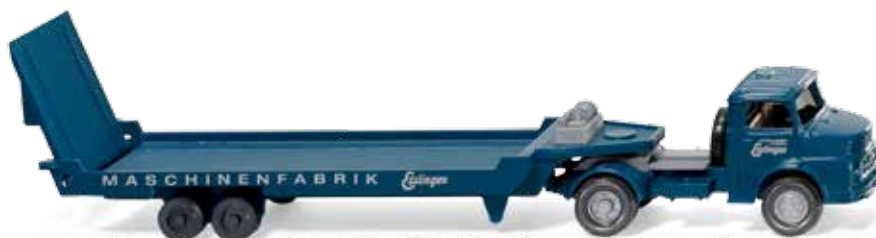
0490 01 Flatbed trailer (MB 1413)