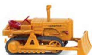
0844 38 Hanomag K55 bulldozer