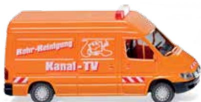
0283 02 Municipal service - MB Sprinter panel truck