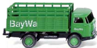
0446 03 Truck with lattice structure in the back (MB LP 321)