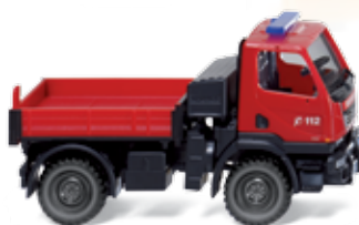
0601 25 Fire service - Unimog U 20