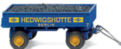
0400 01 Coal trailer