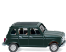
0224 02 Renault R4