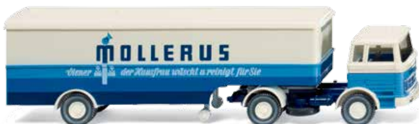
0513 18 Semi-trailer truck (MB 1620)