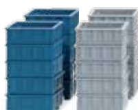
0018 12 Accessories package - stacking boxes