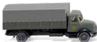
0949 03 Flatbed truck (Magirus) N-gauge 1:160

Beautiful classics – updating the range of models with lots of contemporary verve is what makes this possible! The VW "Bulli" of the first generation with a colorful flower power look is brought into the WIKING program – the "peace generation" of the late 1960s sends its love. The Mercedes-Benz 1413 as flatbed trailer in the colors of "Maschinenfabrik Esslingen" are just as much model fun as the Lanz Bulldog and coal trailer, which have been miniaturized, modeled on the historical prototypes of