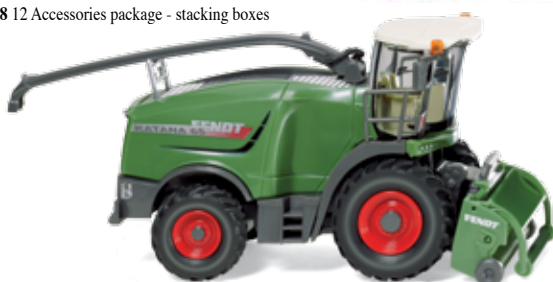
0389 60 Fendt Katana 65 with grass pick-up