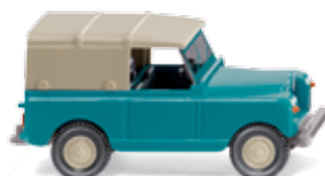
0100 02 Land Rover