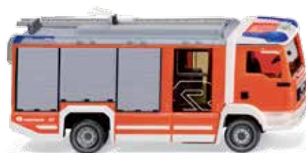
0612 49 Fire service Rosenbauer AT LF (MAN TGL)