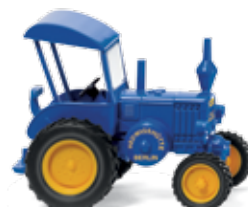
0880 07 Lanz Bulldog with roof